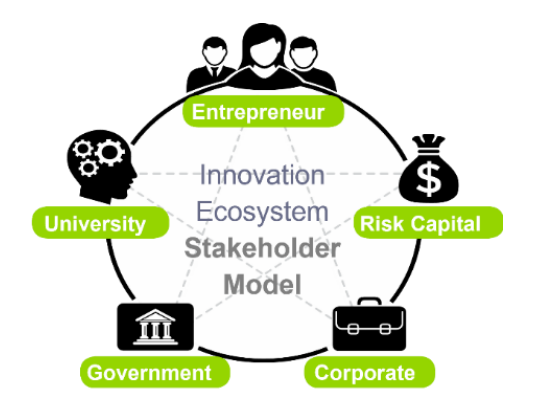
Figure 3: Canonical Innovation Ecosystem Stakeholders

Universities, entrenched in the fabric of the innovation ecosystem, primarily prioritize their tripartite mission of research, education, and service. They serve as pivotal nodes in the knowledge production and dissemination network, boasting a wealth of intellectual capital and a steady flow of skilled human resources. These capacities, however, are often directed towards outcomes that may straddle the boundaries of the regional ecosystem, such as technology transfer and student success, reflecting the inherent tension between their institutional mandate and the geographically bound nature of regional innovation ecosystems.