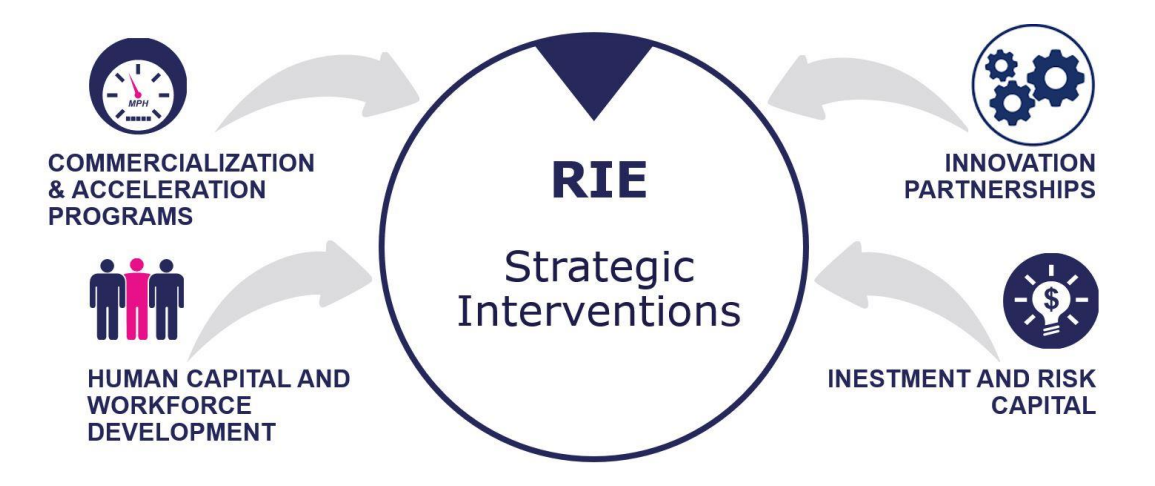
Figure 5: Regional Innovation Engine Strategic Interventions

particularly valuable in the context of regional innovation ecosystem acceleration. Table 4 offers an overview of these interventions, including the specific rationale for each program, the types of metrics that might be associated with their outcomes, and key references and exemplars of programs of this type within the Federal system.