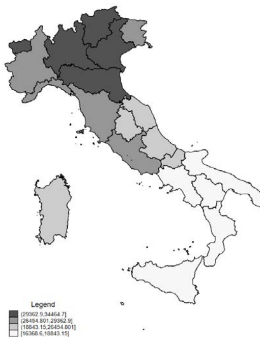
Figure 3b: Income per capita by Region

NOTE: The Figure reports the income per capita by region. Regions with darker color are those where the income per capita is higher. Data Source: ISTAT