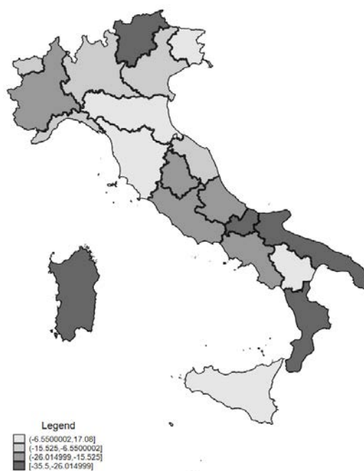
Figure 3a: Difference in Financial Literacy Score between girls and boys.

NOTE: The Figure reports the financial literacy gap between girls and boys by Region. Regions with darker color are those where the financial literacy gap between boys and girls is higher.