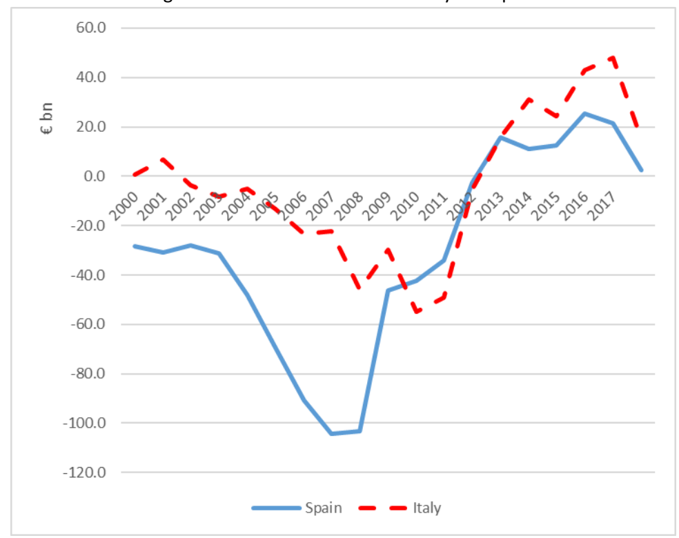
Figure 2: The current account of Italy and Spain

The Target liabilities of GIIPS countries were limited until 2008. However, this masks a substantial difference of behavior between Italy and Spain. Italy had limited current account deficits; Spain had much larger deficits (see Figure 2), but their effects on Target liabilities were offset by large capital imports (Figure 3). In other words, Spain was transferring deposits abroad in order to pay for an excess of imports over exports of goods, but was also receiving transfers of deposits from abroad, paying for the assets it was selling abroad.