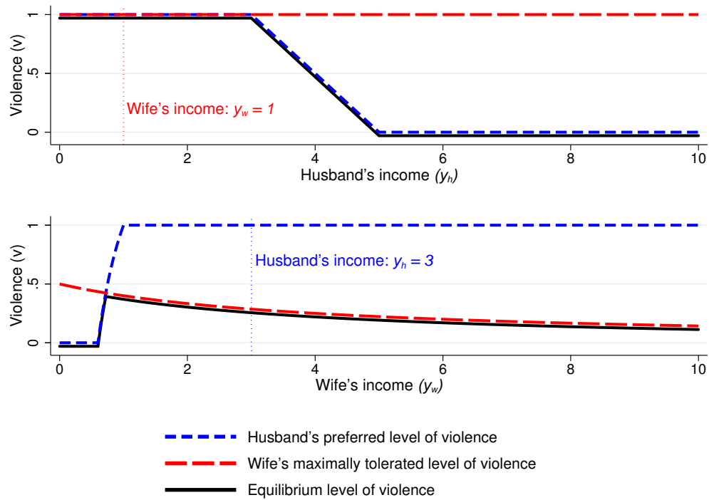
Figure B1: Numerical example of the impact of changes in husband's or wife's income on preferred and equilibrium levels of violence