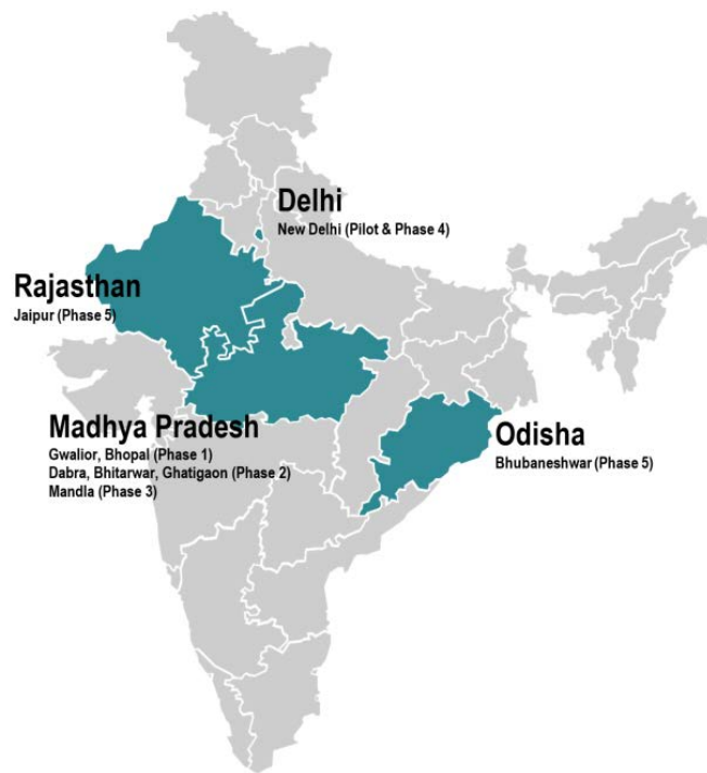
Figure 1: Study locations