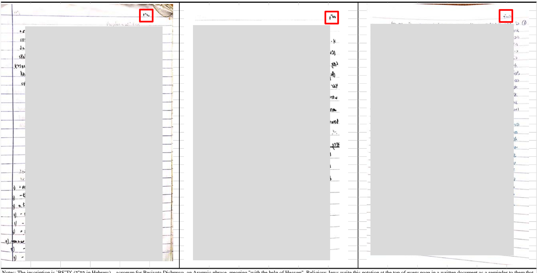
Figure A1: Sample of Religious Students' Booklets

Notes: The inscription is `BS''D' (בס"ד) in Hebrew)-- acronym for Besiyata Dishmaya, an Aramaic phrase, meaning "with the help of Heaven". Religious Jews write this notation at the top of every page in a written document as a reminder to them that all comes from God.