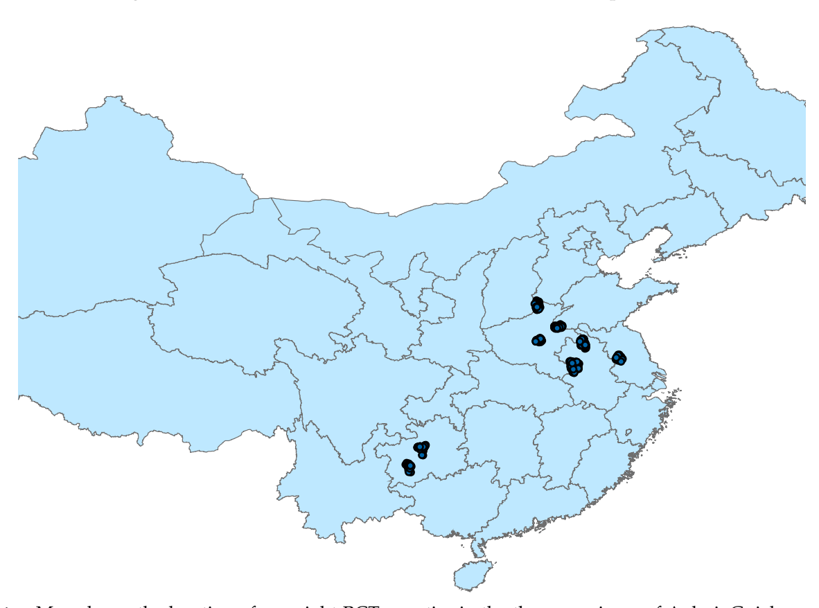
Figure A.1: Provinces and Counties Where RCT Was Implemented

Notes : Map shows the location of our eight RCT counties in the three provinces of Anhui, Guizhou and Henan. The dots indicate participating villages and the boundaries indicate Mainland Chinese provinces. Section 2 and Appendix F for discussion.