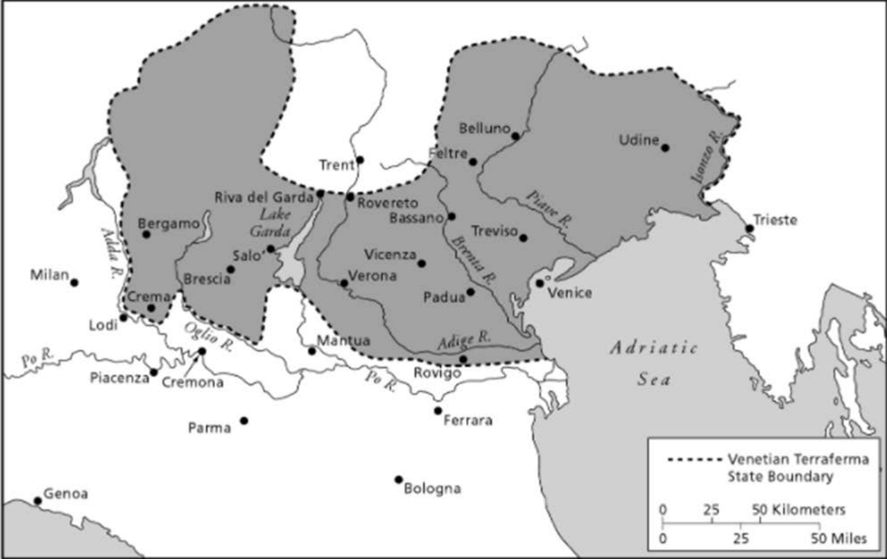
Map 3.1. Venice's Terraferma.