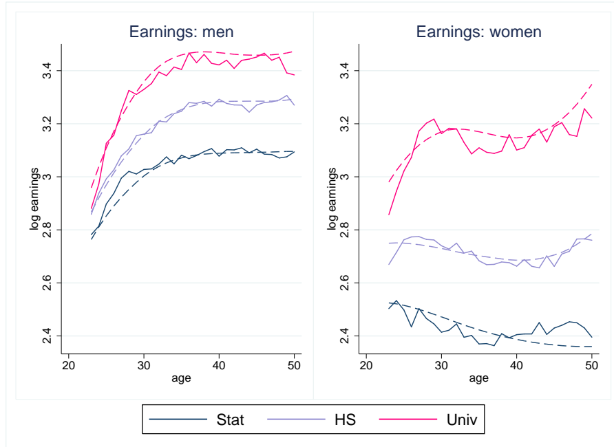
Figure 2: BHPS data and model predictions: log annual earnings for men and women over the lifecycle

Notes: Full lines are for BHPS data and the dashed lines are for model simulations. Annual earnings in real terms (£1,000, 2008 prices).