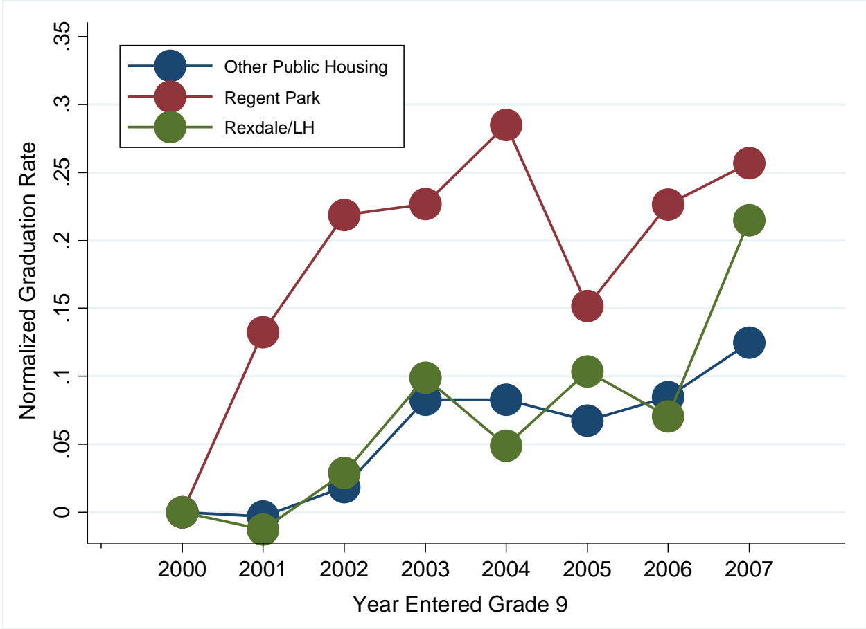
Figure 2B Normalized Fraction Graduated from High School by 5th Year Among 2000 to 2007 Grade 9 Students from Regent Park and Non-Pathways Toronto Public Housing Projects

Notes: This figure shows the same information as in Figure 2A except that the high school graduation rate for each group for the 2000 cohort was subtracted from the actual rate for each cohort, leading to a baseline value of zero for all groups in 2000.