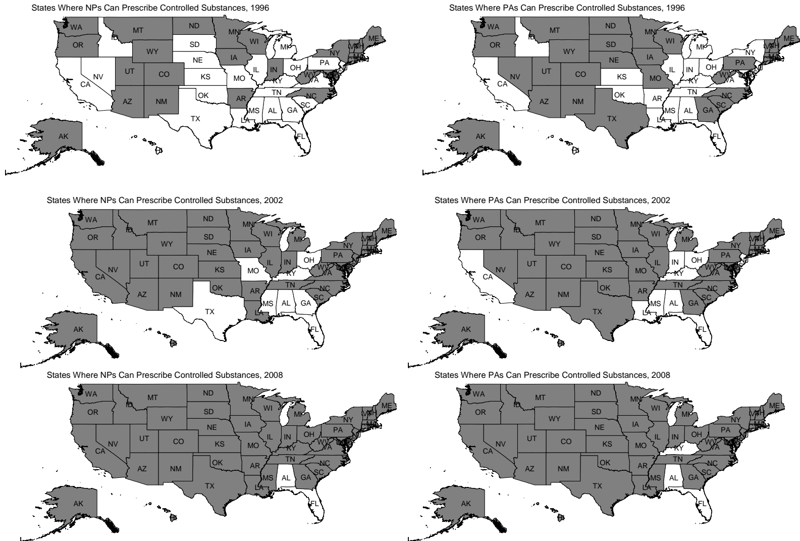
Figure 2. States where NPs and PAs can Prescribe Controlled Substances, 1996-2008

Source: Author's tabulations from The Nurse Practitioner , Annual Legislative Update (various years) and Abridged State Regulation of Physician Assistant Practice , distributed by the American Academy of Physician Assistants.