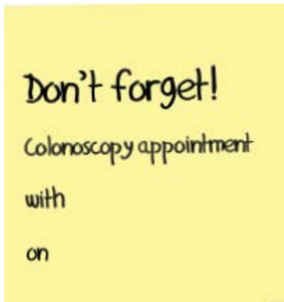
Figure 2. Experimentally varied reminder mailers sent to study participants.