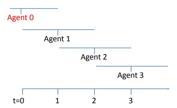
Figure 1: Demographics

Consider an overlapping-generations model where agents live for two periods. We suppose for simplicity that there is a single agent born in each period (generation), and each agent's payoffs are determined by his interaction with agents from the two neighboring generations (older and younger agents). Figure 1 shows the structure of interaction between agents of different generations.