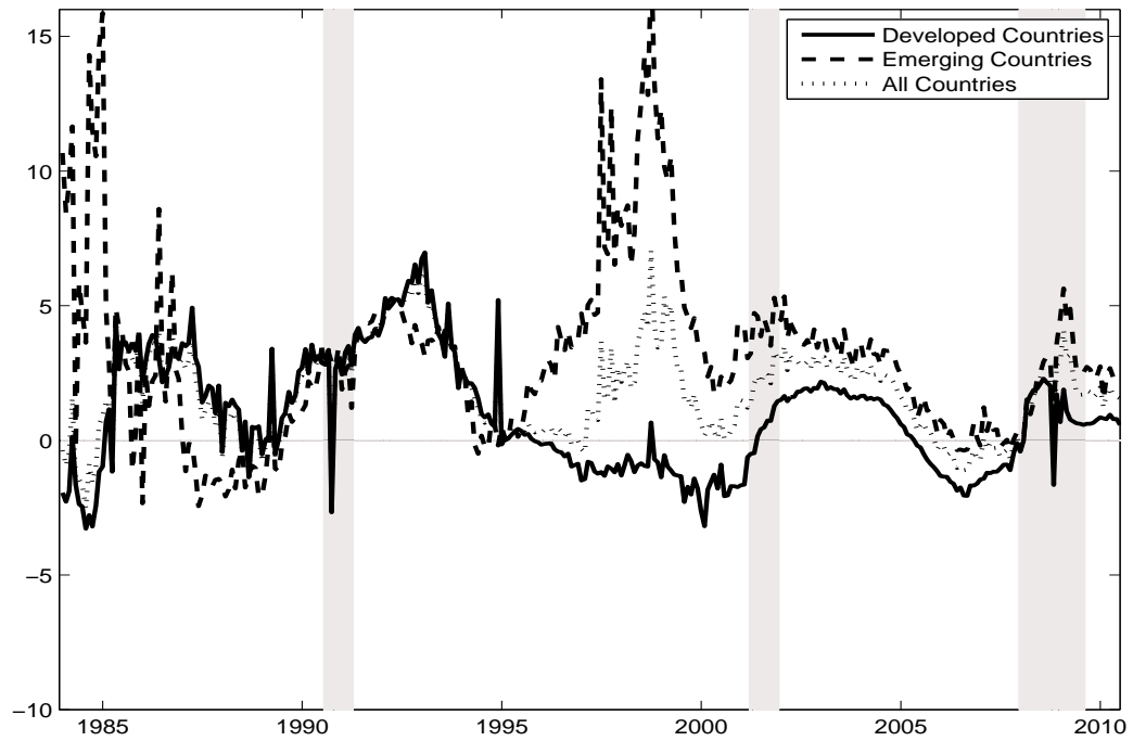
Figure 1: Average 12-month Forward Discounts on Three Currency Baskets

This figure presents the average 12-month forward discounts on three currency baskets (developing countries, developed countries, and all countries). The shaded areas are U.S. recessions according to NBER. The sample period is 11/1983–6/2010.