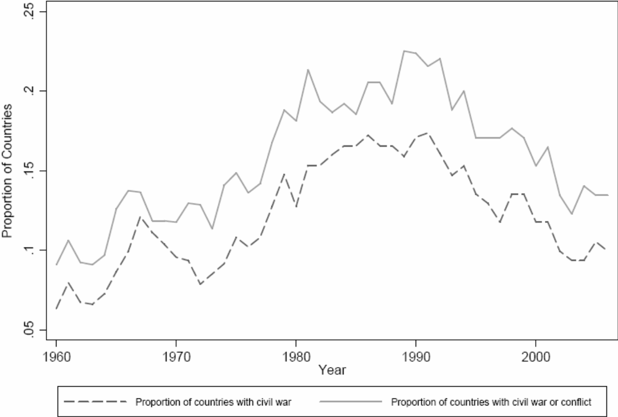
Figure 2: Proportion of countries with an active civil war or civil conflict, 1960-2006