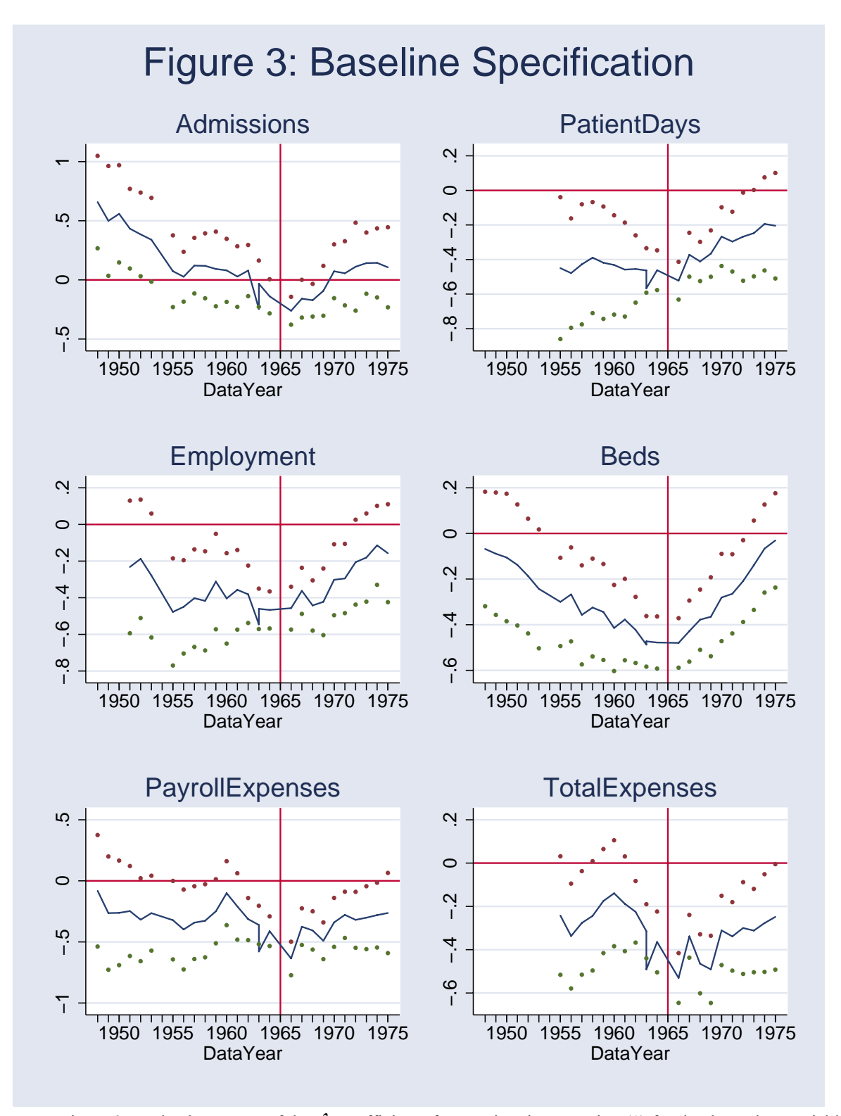
Note: Figure 3 graphs the pattern of the \lambda_i coefficients from estimating equation (1) for the dependent variable given above each graph; all dependent variables are in logs. The scale of the graph is normed in the reference year (1965) to the average difference in the dependent variable between the south and west relative to the north and northeast. The dots show the 95 percent confidence interval on each coefficient relative to the reference year (1965).