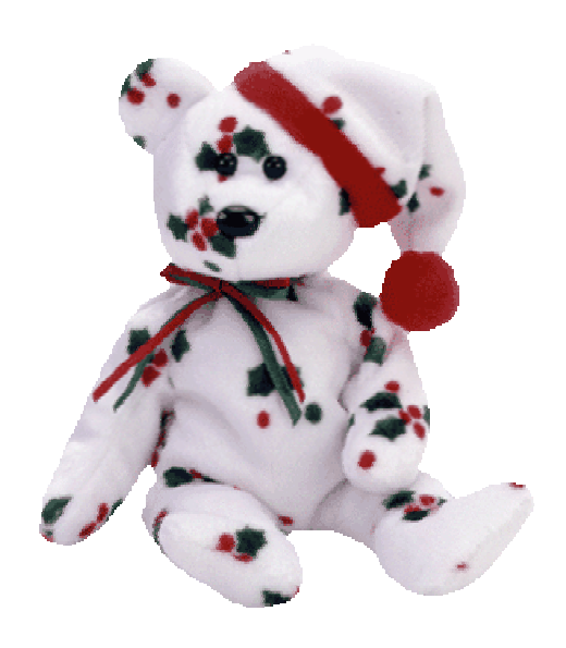
(d) 1198 Holiday Teddy Beanie Baby