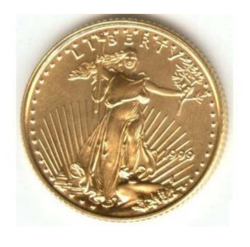
(a) 1/16 oz 5 dollar gold coin of 2002 vintage (gold American Eagle)