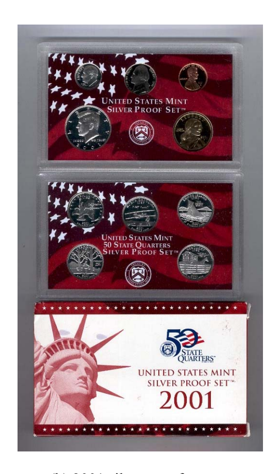
(b) 2001 silver proof set.