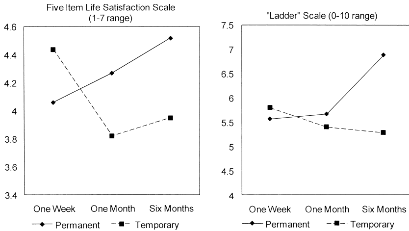
Fig. 2.3 Happiness over time: Permanent versus reversible colostomy

one measure, or remained at a roughly constant level of happiness according to the other.