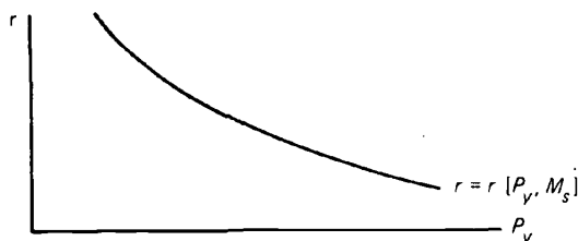
FIGURE 9-1. Graphical Relation Between Prices and the Balance of Payments—Monetarist View

An increase in the price of exports would raise the household's income. So would a rise in the price of the domestic goods since y > y_h . Assume that the household expects such increased income to be temporary and holds real consumption constant. This assumption implies that households engage in short-run hoarding or saving of money in the face of the expectation that real income will fall to