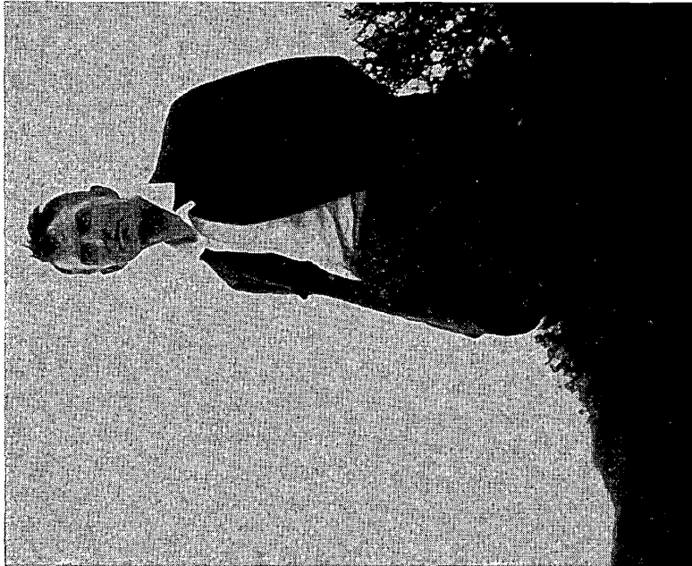
AT AGE 39