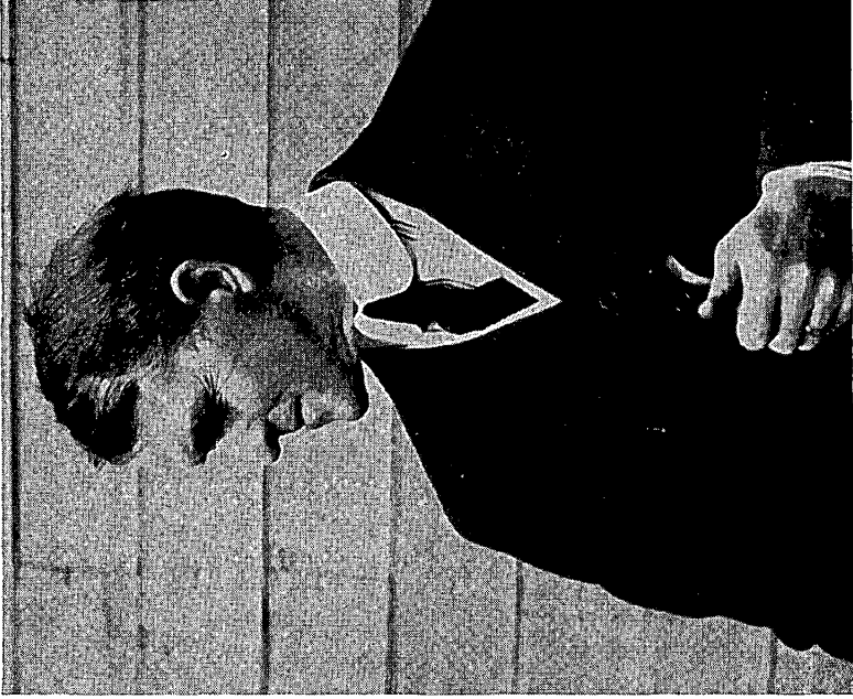
AT AGE 44