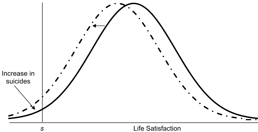
Fig. 10C.1 Life satisfaction and suicide

life satisfaction and suicide across various domains—age, socioeconomic status, time, and the like. The chapter reaches two conclusions. First, life satisfaction and suicide are not highly correlated, indeed the correlation is often of the wrong sign. Second, it is not clear whether life satisfaction or suicide is a better measure of well-being. Suicide seems to reflect temporal factors that one would not expect, such as day of the week, while life satisfaction is measured with difficulty.