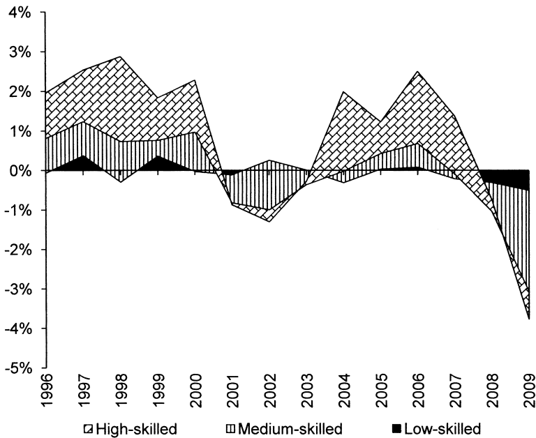
Fig. 18.3 Labor services contributions by skill type, 1996–2009