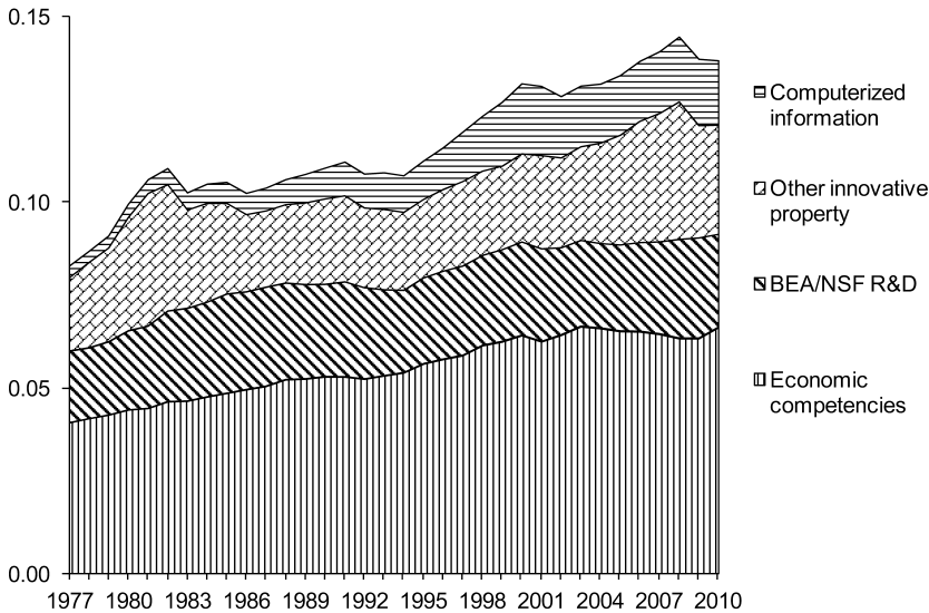
Fig. 18.4 Intangible investment by broad type, 1977–2010