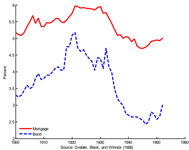
Figure 2: Bond and Mortgage Rates (1900-1953)