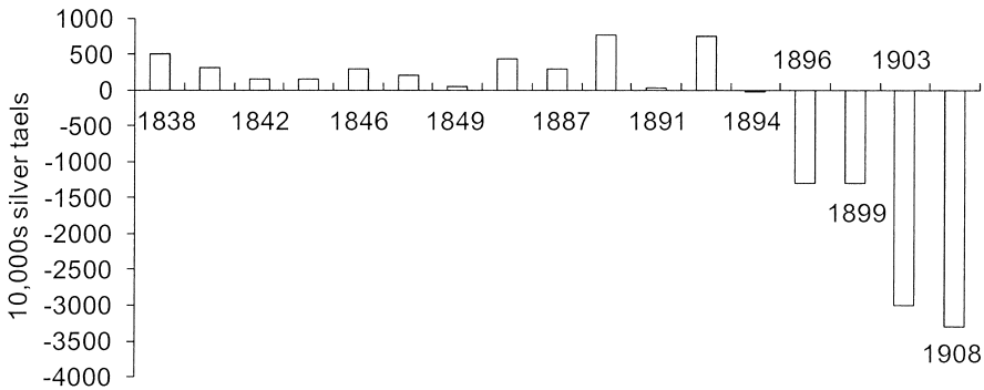
Fig. 7.3 Annual fiscal surplus of the Qing China

Sources: Zhang (2003) for the period of 1838 to 1849, Sheng (2002) for fiscal revenue data for 1885–1894, Chen (2000) for annual expenditure data for 1885–1894, and Tang, Lu, and Niu (1998) for both fiscal revenue and expenditure data for 1896 and thereafter.