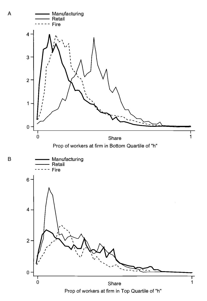
Fig. 5.4 Between-firm distributions of human capital, by industry: A, proportion of workers at firm in bottom quartile of h; B, proportion of workers at firm in top quartile of h