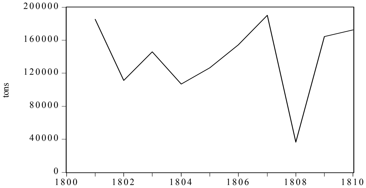
Figure 1: Tonnage of American Ships Entering Great Britain, 1801-1810

Source: Great Britain. "An Account Relating to Imports and Exports," February 18, 1812, Parliamentary Papers , Vol. 10, 1812, p. 5.