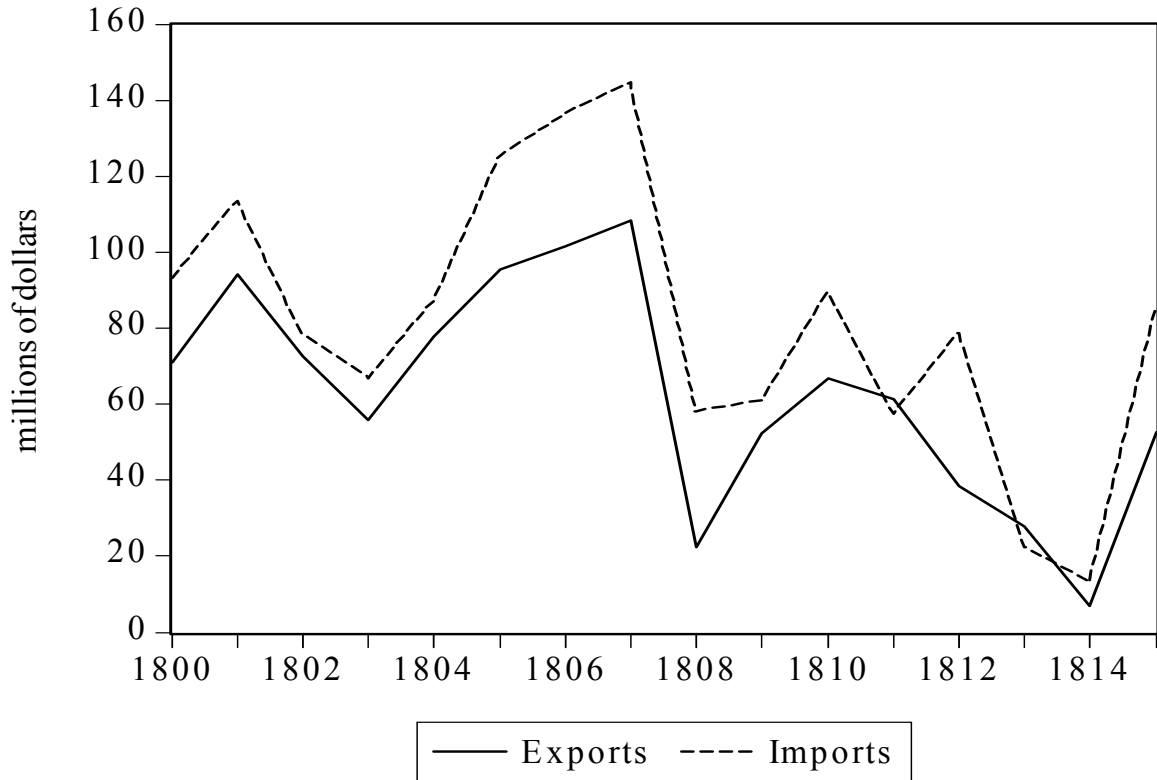
Figure 2: U.S. Merchandise Trade, 1800-1815