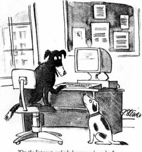
"On the Internet, nobody knows you're a dog."

Before the Internet established itself as an important tool for communication, information search, and purchasing, Peter Steiner foresaw that the emerging medium would create some degree of anonymity for its participants (see his famous 1993 New Yorker cartoon above). In this paper, we analyze whether the increased difficulty in accurately assessing a consumer's willingness to pay on the Internet and consumers' ease in finding information affects race and gender discrimination in car retailing—a large industry in which prices are negotiated.