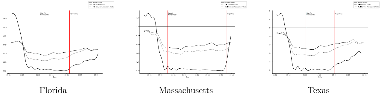
(b) Individual State Responses

Figure 1a presents the average of each measure of mobility and restaurant activity, centered around stay-at-home and reopening dates. Figure 1b presents Yelp Reservations, SafeGraph visits to all places-of-interest, and SafeGraph visits to full-service restaurants for three states. Due to a high degree of day-of-week variation, each line presents a trend line of the outcome of interest, calculated using a LOESS seasonal-trend decomposer.