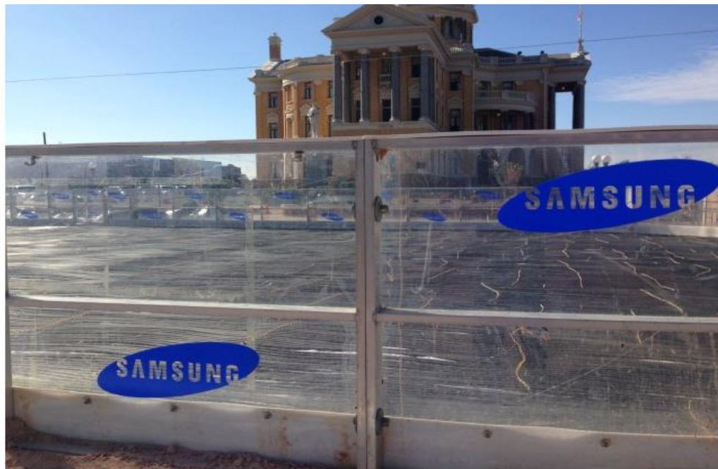
Winter ice rink in Marshall, Texas. The historic county courthouse is in the background.