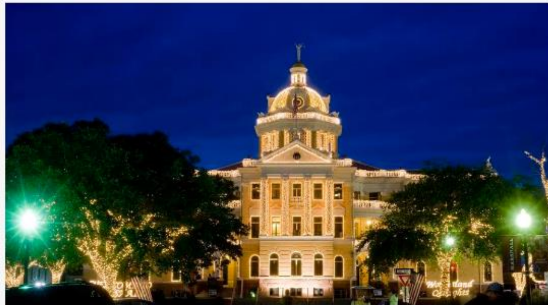
Historical Harrison County Courthouse is the center stage event for 27th Annual Wonderland of Lights Festival that begins November 27

Source: Marshall News Messenger - Marshall, TX