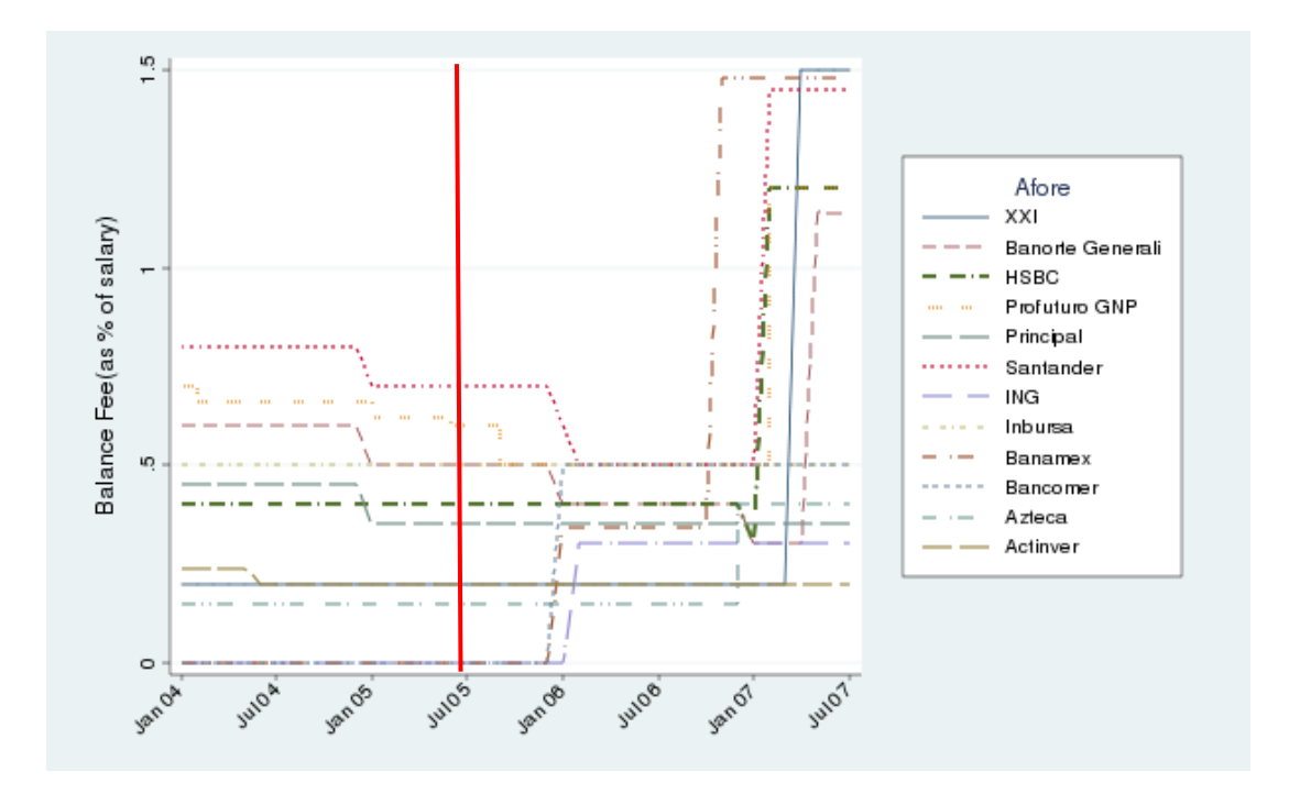
FIGURE III BALANCE FEE CHANGES, JANUARY 2004-JULY 2007