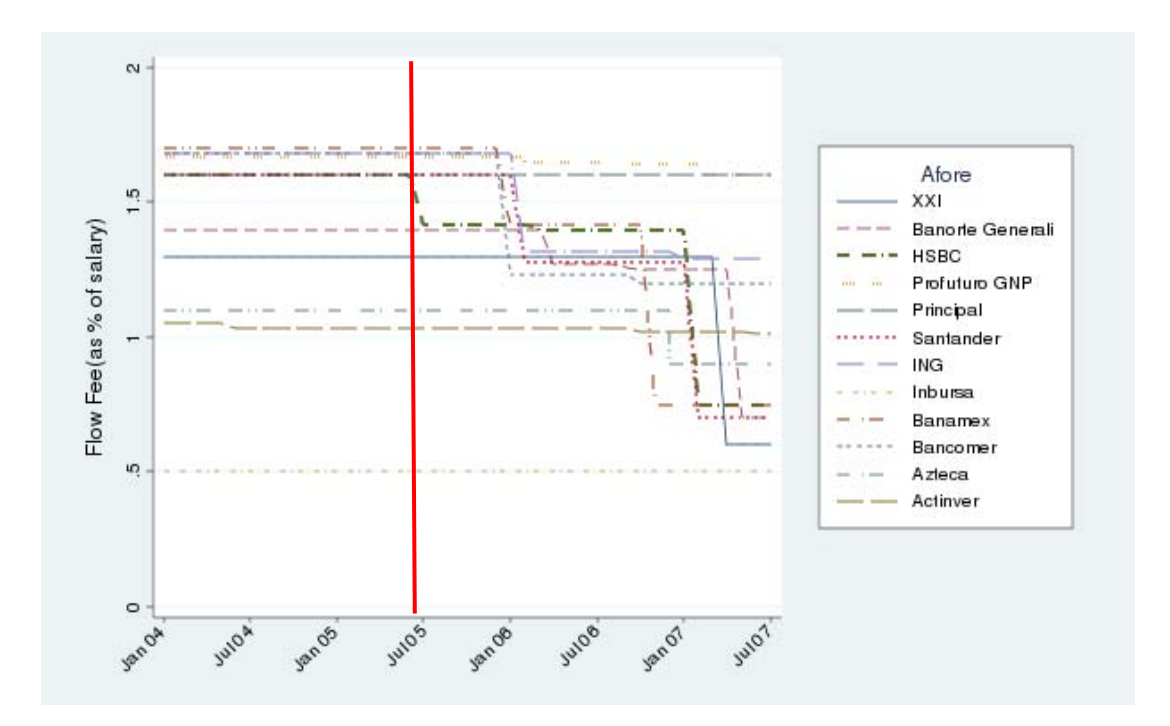
FIGURE II FLOW FEE CHANGES, JANUARY 2004-JULY 2007