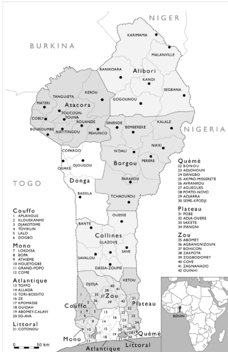
Map 1: Administrative map of Benin