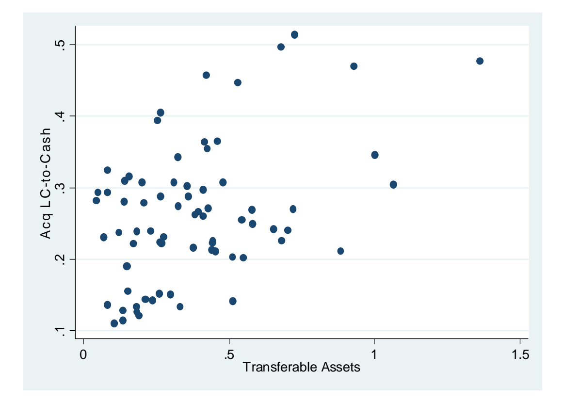
Fig. 3. Line of credit availability and transferable assets. The figure depicts the relationship between line of credit availability and our composite proxy for industry, and not firm specificity ( Transferable Assets ). On the y-axis, we depict the ratio of total credit lines divided by total credit lines plus cash balances (the variable Acq LC-to-Cash in equation 32 in the text). On the x-axis, we depict the variable Transferable Assets . The data represent 3-digit SIC industry averages over our entire sample period (1987–2008), for industries with five or more firms.