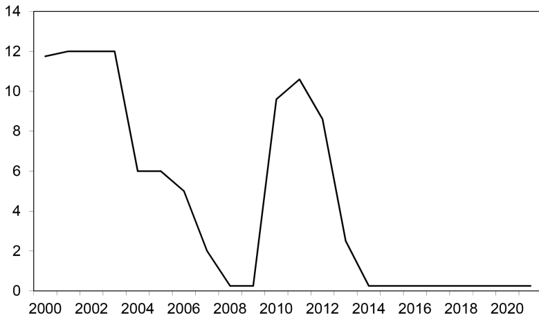
Fig. 3.3 Months until H-1B cap is reached from filing start date by fiscal year