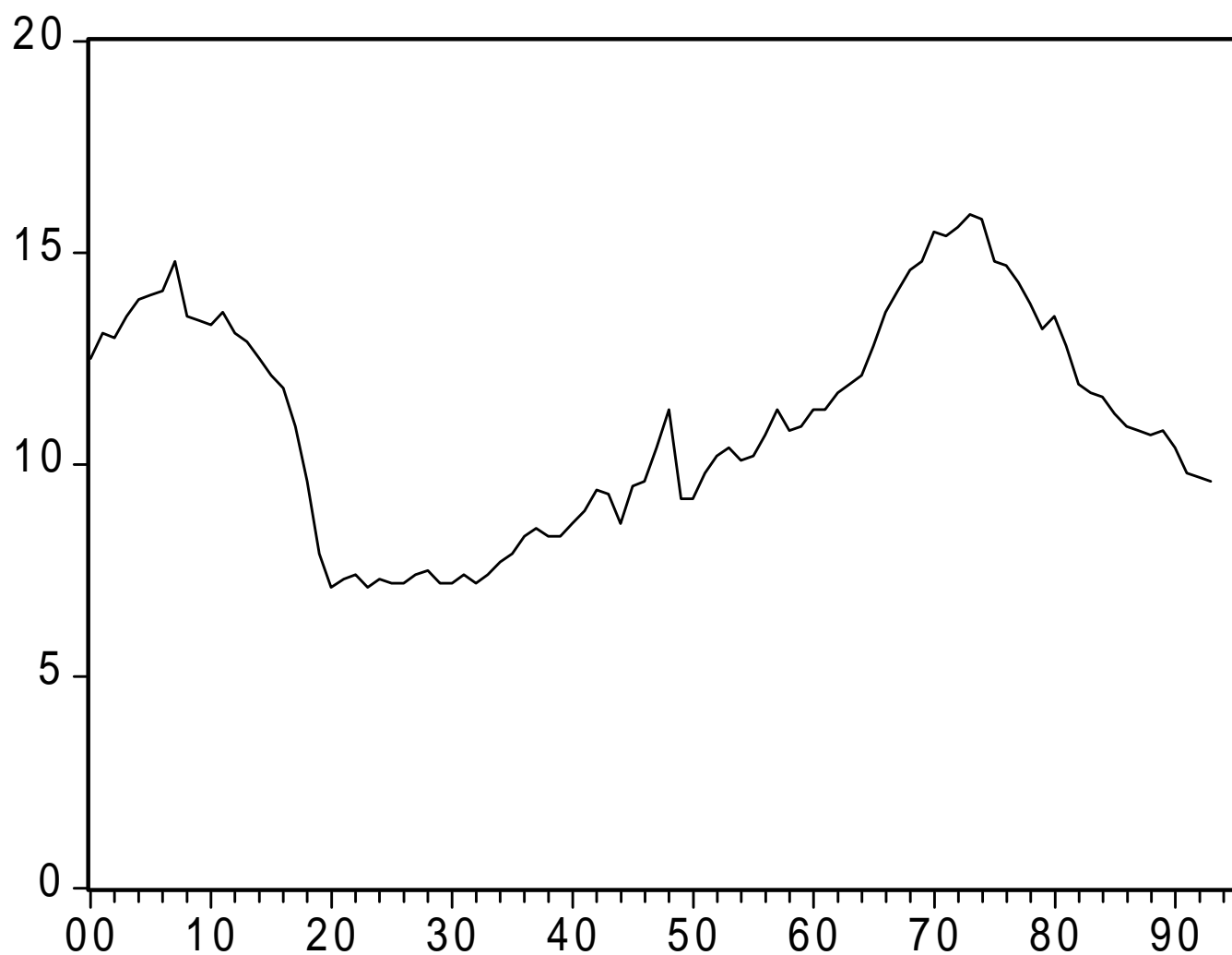
Figure 2: Cirrhosis Death Rate, 1900-1993 Deaths per 100,000 Population