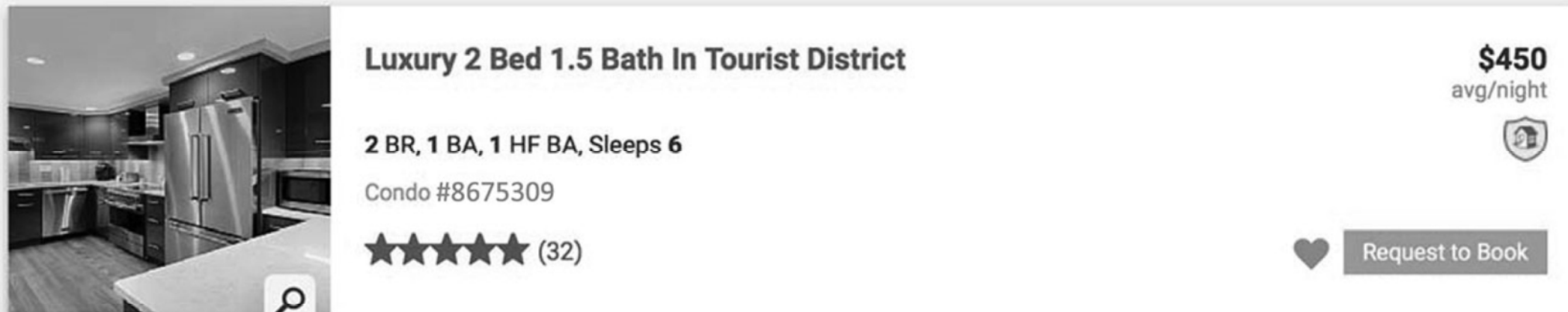
Figure 5: Sample search result on HomeAway