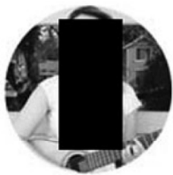
Figure 1: Sample guests on Airbnb