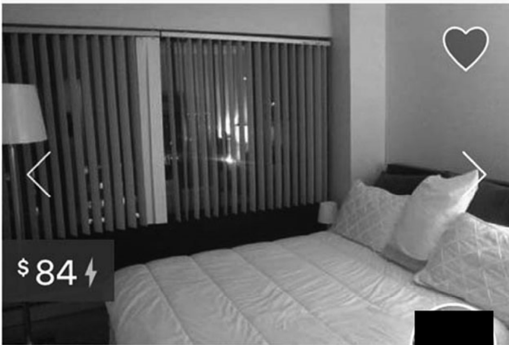
Cozy, high-rise room, stunning view Private room · ★★★★★ · 92 reviews