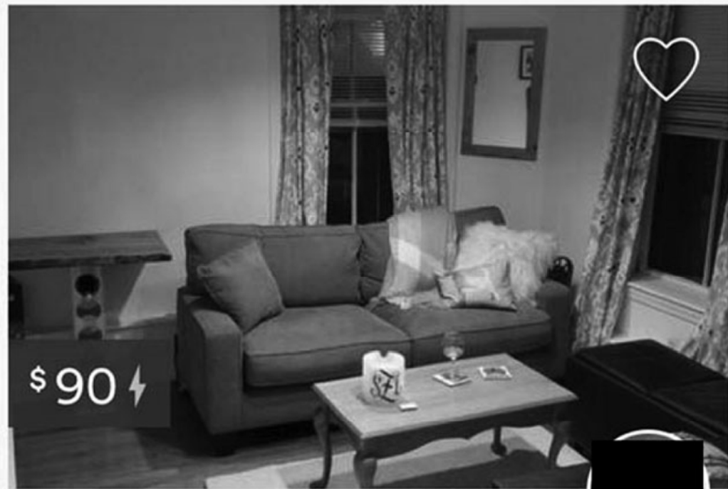
Convenient downtown hideaway Entire home/apt · ★★★★★ · 5 reviews