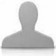
Figure 3: Sample guests on HomeAway