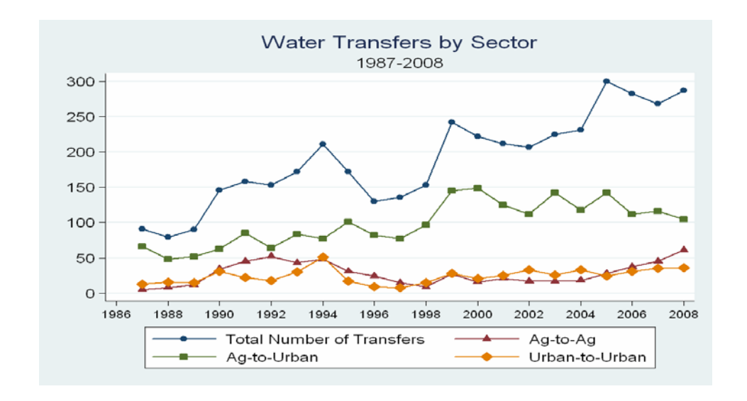
\label{lem:figure loss} \emph{Figure 1} \\ \textbf{Number of Water Transfers by Sector in 12 Western US States} \\