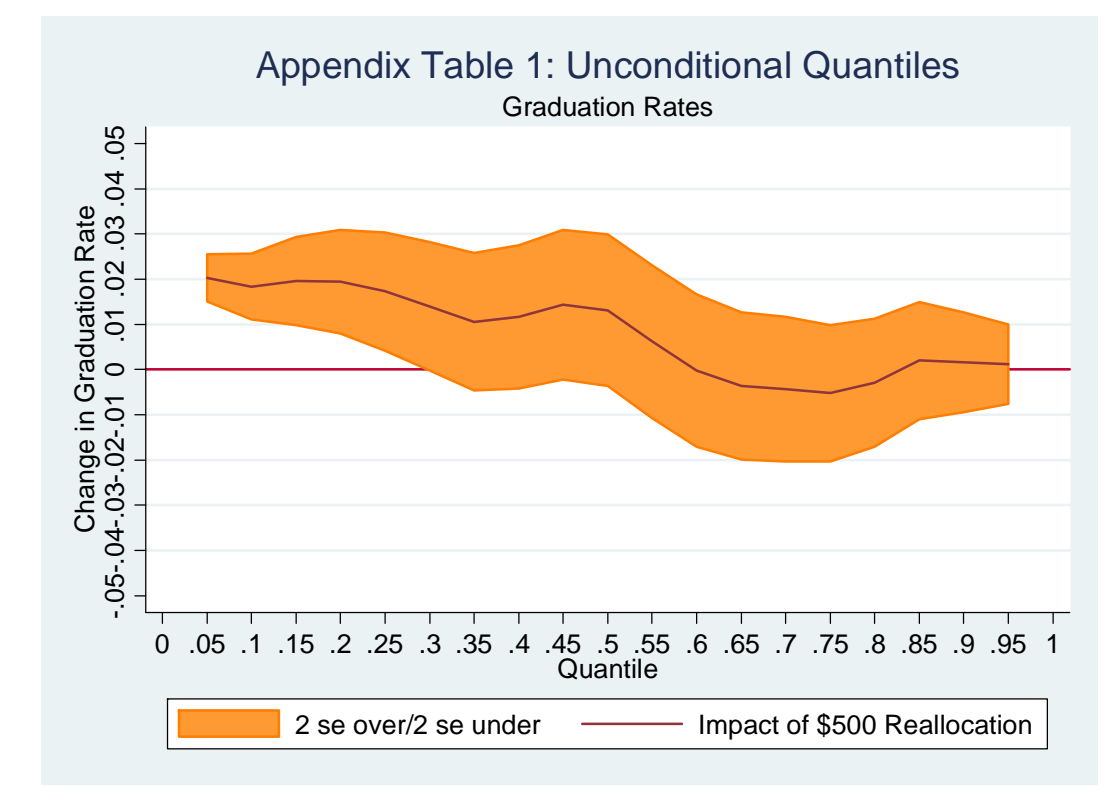
Notes: The shaded region denotes a 95 percent confidence band around the estimated value.