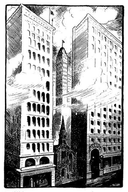
Nearer, My God To Thes

In this section we study the connection between concentration and anger. We start by characterizing the symmetric pooling equilibria in an oligopoly where both types of firm charge the same price. Of course, there may be separating equilibria too. But we focus our analysis on pooling equilibria because we know that in a pooling equilibrium there is no anger, while in a separating equilibrium there is some anger (amongst consumers served by selfish firms). Thus, a simple way to establish a connection between an increase in anger and a more concentrated market structure (and, eventually, monopoly) would be to show that as the number of firms fall pooling equilibria are harder to sustain. Of course, there may be other ways to connect anger and concentration, and these may even explain a large part of this correlation. But the channel we study has the considerable advantage of being both simple and tractable, as well as consistent with elements of the historical experience in the US, where public preoccupation with the increased size of corporations gave rise to the regulatory movement. Figure 1, is a graphic illustration of this fear (taken from Marchand, 1998).