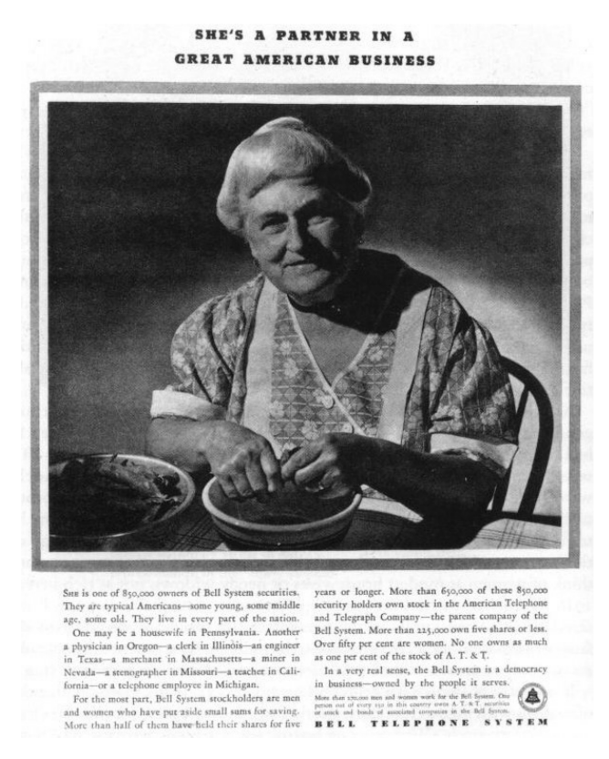
Figure 3. An ad in the campaign by Bell Telephone System to humanize the corporation.

Another particular form of public relations that is consistent with our approach is that firms often "humanize corporations", emphasizing the identity of the founder or main shareholder. One interpretation of this relatively common form of marketing is that by doing so a firm is more likely to be perceived to have the attributes of humans (such as kindness) than of "soul-less" corporations that "only care about profits". Again, such language is unlikely to make sense in a world where customers only care about material payoffs. Figure 3 is taken from Marchand (1998), who studies the role of corporate imagery in the creation (and maintainance) of the perception that corporations in America have a "soul" (interpreted by the author as forms of kindness, tolerance and other positive human attributes).