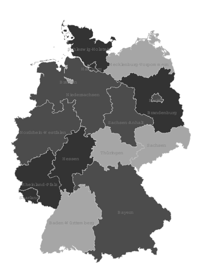
Figure 2 Concentration of FD I relative to Dom estic Firm s, Germ any 1998

Note: The map shows the concentration of FDI calculated as share of workers employed in foreign-owned firms in a Bundesländer in year 1998. The shades of gray (darker color denotes higher concentration) are three and intervals are spaced so that Landers are equally distributed among them (roughly five Landers per interval).