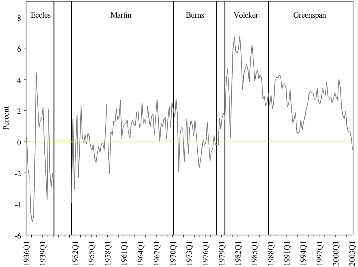
Figure 3 Ex Ante Real Interest Rate

The observations for 1941Q2 to 1951Q1 are missing because we exclude those years from the estimation. The vertical lines show the quarters in when each Federal Reserve chairman's tenure began.