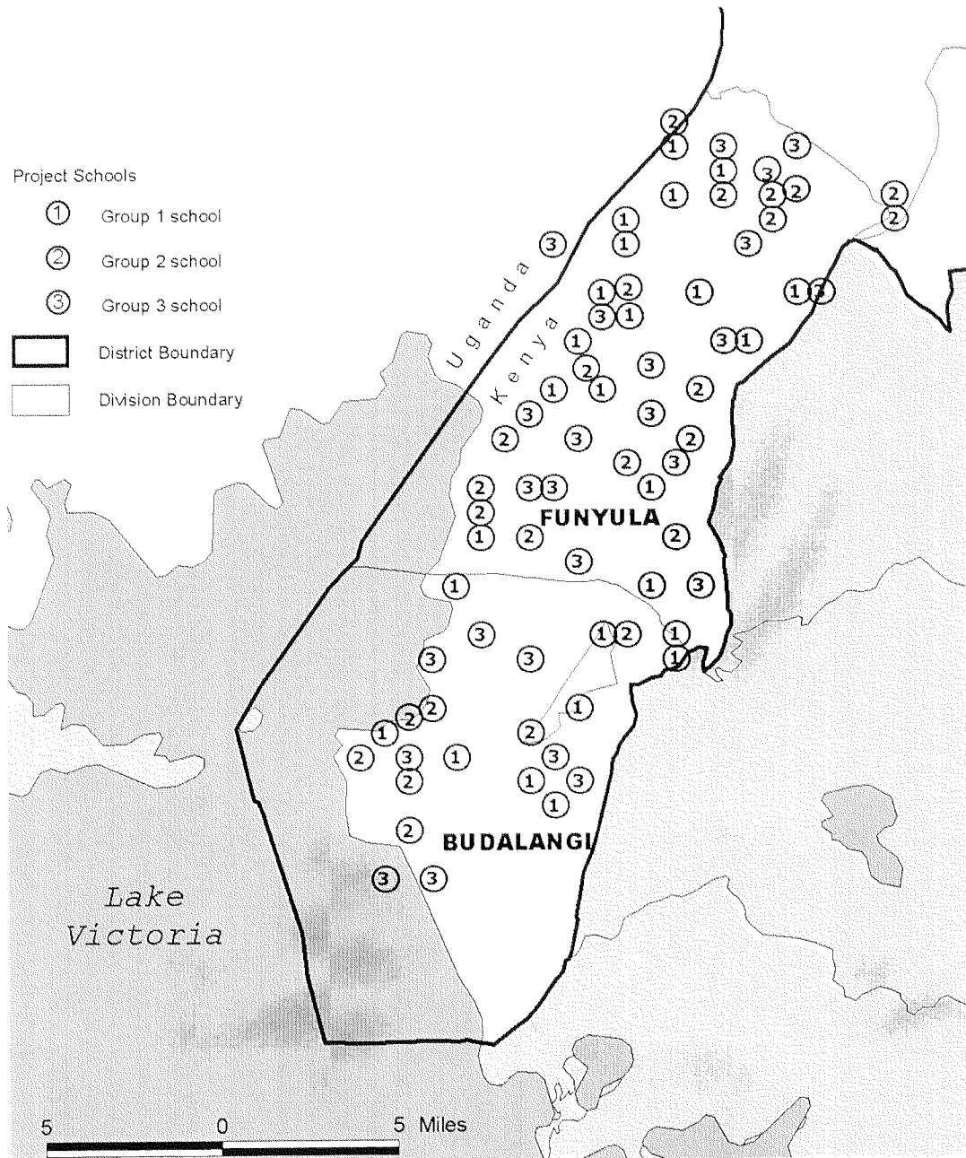
Figure 1: Primary School Deworming Project Schools, Busia District, Kenya 61