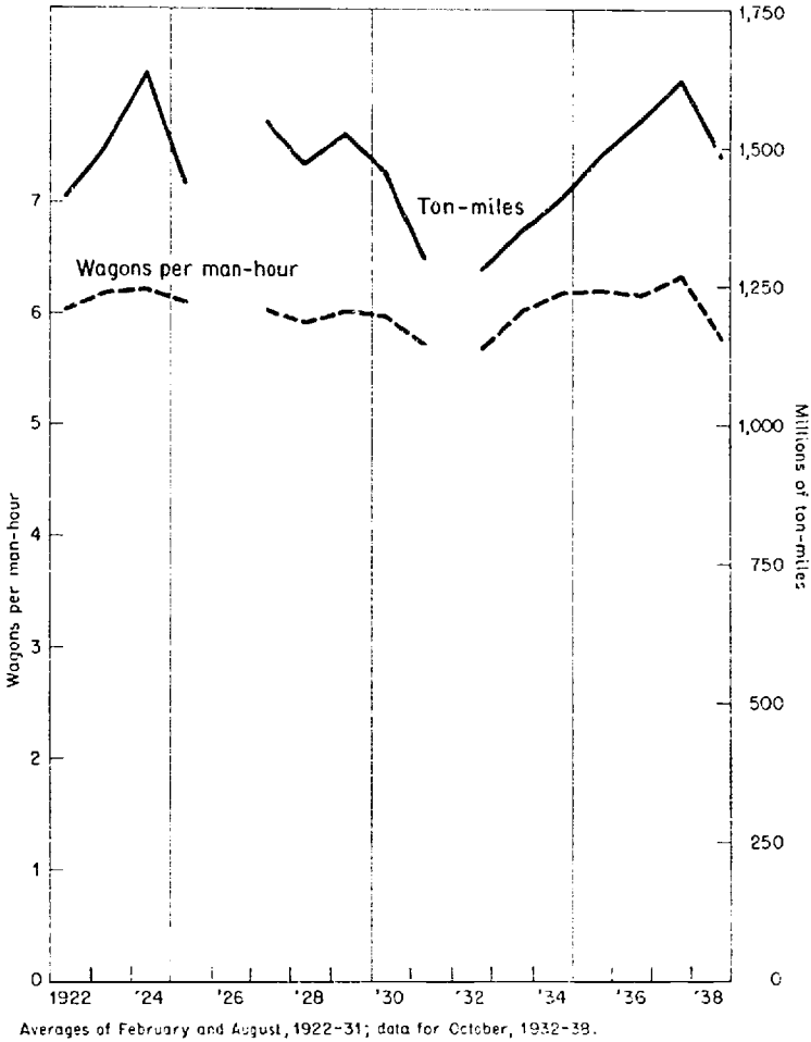
Ton-miles, and Wagons Detached in Marshalling Yards per Man-hour of Shunting Staff Labor, Various Dates

vice since 1921 is highly irregular, but we think we discern an upward drift in every expansion, a downward drift in all contractions except, perhaps, 1926-27 (Chart 24). 5