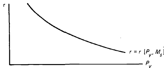
FIGURE 9-1. Graphical Relation Between Prices and the Balance of Payments—Monetarist View

An increase in the price of exports would raise the household's income. So would a rise in the price of the domestic goods since y > y_h . Assume that the household expects such increased income to be temporary and holds real consumption constant. This assumption implies that households engage in short-run hoarding or saving of money in the face of the expectation that real income will fall to