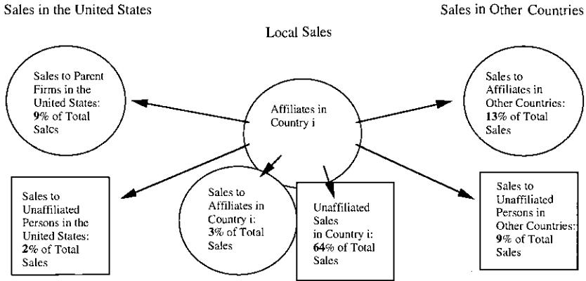
Fig. 7.2 The distribution of total sales to affiliates and nonaffiliates in the United States, locally, and in other countries